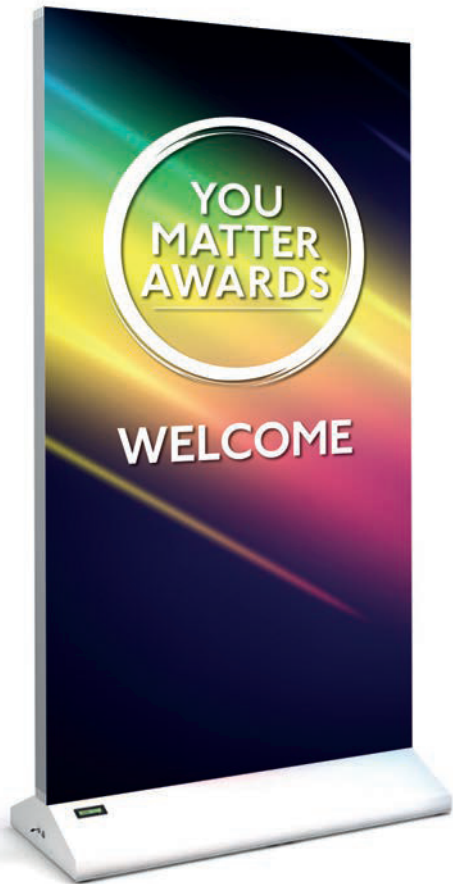
Example: Rechargeable 2 m x 1 m lightbox