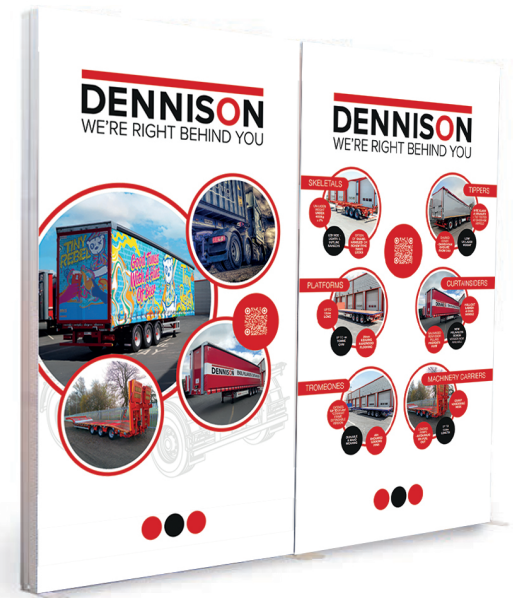
Example: 2 x 3 m x 2 m lightbox panels placed side-by-side to create a backwall

We can provide rechargeable two-metre and one-metre-high lightboxes , compact displays that are typically used to welcome visitors. If you are seeking larger lightboxes, we also offer two-metre and three-metre-wide lightboxes that can be used to create a backwall.